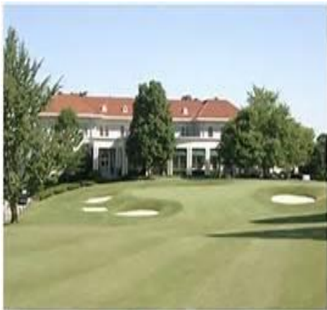
Louisville Country Club

The deadline for the GIS scholarship has been extended until Friday, December 2nd. The form must be completed and returned to admin@kgcsa.info before this date. The application can be found on the member side of our website, www.kgcsa.info . This $1,500 scholarship is designed to help offset the costs of attending GCSAA's annual event being held in Orlando, Florida February 4-9. It is available to any current member of the KGCSA. Not a member? Log onto the website www.kgcsa.info for details on how to join. Take advantage of this opportunity today